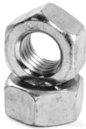
DIN 934-1987 CLASS 10