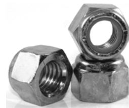
IFI -100/107-2002 GRADE C