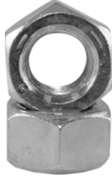
ANSI/ASME B18.2.2 SAE J995 GRADE 5 ASTM A563 GR B