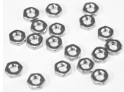
ANSI B18.6.3 PASSIVATED