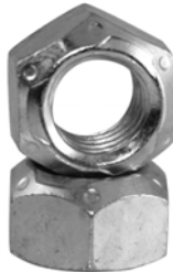
IFI -100/107-2002 GRADE C