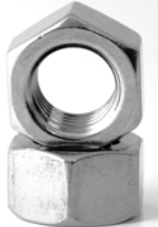
ASME B18.2.2 PASSIVATED