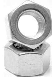
ASME B18.2.2 PASSIVATED