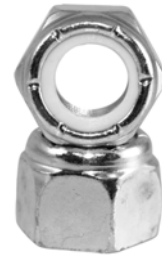
STEEL NYLON INSERT LOCKNUT ZINC TO IFI-100/107