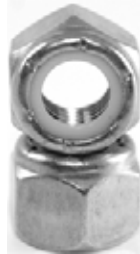
18-8 STAINLESS IFI-100/107