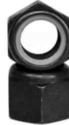
IFI -100/107-2002 GRADE C