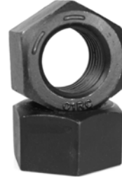
ANSI/ASME B18.2.2 SAE J995 GRADE 5 ASTM A563 GR B