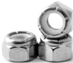
316 STAINLESS IFI - 100/107 PASSIVATED