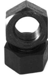
ASME/ANSI B18.2.2-1987 SAE J995 GRADE 8