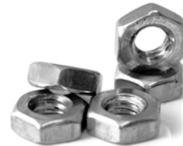
ASME B18.2.2 PASSIVATED