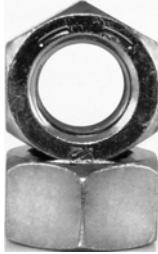
ASME/ANSI B18.2.2-1987 SAE J995 GRADE 8