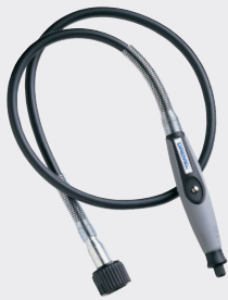
22501 Flex Shaft Attachment Grainger #3W840

Comfort Grip Hand-Piece Allows comfort and fingertip control.