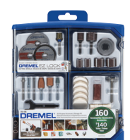
710-08 160 pc All-Purpose Accessory Kit Grainger #5EEV1

4 metal-cutting wheels, 3 thin-cut wheels and 3 plastic cutting-wheels