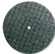
426 Cut-off Wheel Grainger #3W842

Ideal for shaping, smoothing or removing material