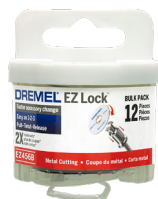
EZ456B EZ Lock™ 1-1/2" Metal Cut-Off Wheels (12 Pack) Grainger #1PKX6