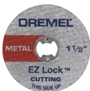
EZ456 EZ Lock™ 1-1/2" Metal Cut-Off Wheels (5 Pack) Grainger #1PKX5

The Dremel EZ Lock makes accessory changes easy as PULL - TWIST - RELEASE.