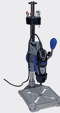
220-01 WorkStation™ Grainger #44K725

Integrated Shaft Lock Button For easy accessory changes.