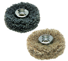
511E Abrasive Buffs Grainger #1PKY1

EZ Lock Finishing Abrasive Buffs 320 Grit (2 Pack)