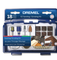
EZ686-01 EZ Lock™ / EZ Drum™ Kit Grainger #34E364

Ideal for cutting, sanding, polishing and cleaning