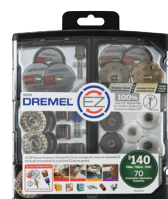
EZ725 70 pc EZ All-Purpose Accessory Storage Kit Grainger #39FV52

Ideal for cutting, sanding, polishing and cleaning