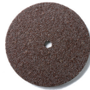
409 Cutting Wheel Grainger #3W841

1-1/4" Fiberglass Reinforced Cut-off Wheels, 5 Pack