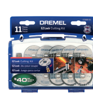
EZ688-01 EZ Lock™ Cutting Kit Grainger #3DRN9

For all of your sanding and grinding applications