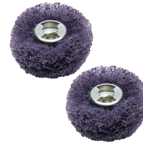
512E Finishing Buff Grainger #1PKY2

EZ Lock Finishing Abrasive Buffs 320 Grit (2 Pack)