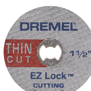
EZ409 EZ Lock™ Cut-Off Wheels (5 Pack) Grainger #3DRN7

EZ Lock™ 1-1/2" Thin Cut, Cut-Off Wheels