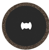
EZ506CU 1/2" Premium CBN Metal Cutting Wheel Grainger #31MK39

For use with exclusive EZ Lock Accessories