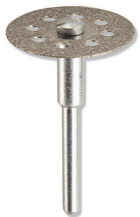
545 Diamond Wheel Grainger #1UH72

Tool Holder Holds tool at 90 degrees horizontal for polishing metal objects, sanding different shapes and grinding metal pieces.