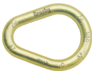
A-341 Alloy Pear Shaped Links