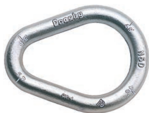
G-341 / S-341 Weldless Sling Link

*Based on single leg sling (in-line load), or resultant load on multiple legs with an included angle less than or equal to 120°. Minimum Ultimate load is 5 times the Working Load Limit. †† Welded Link.