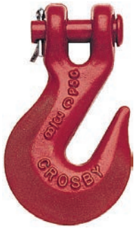
H-330 / A-330 Clevis Grab Hook