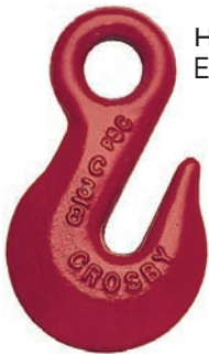
H-323 / A-323 Eye Grab Hook