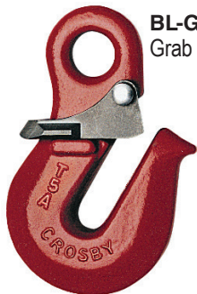
BL-GRB Grab Hook with Latch