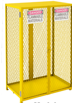
Model EGCVC18-SC-50 Holds 18 gas cylinders