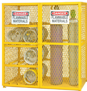
Model EGCC8-9-50 Holds 9 vertical & 8 horizontal gas cylinders