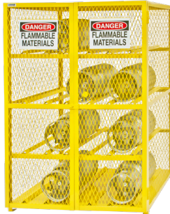
Model EGCC12-50 Holds 12 gas cylinders