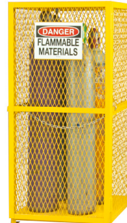
Model EGCVC9-50 Holds 9 gas cylinders