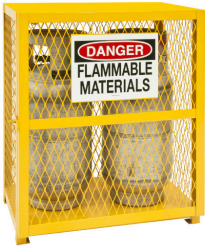
Model EGCVC2-50 Holds 2 gas cylinders