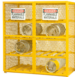
Model EGCC16-50 Holds 16 gas cylinders