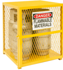
Model EGCVC4-50 Holds 4 gas cylinders