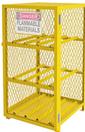
Model EGCC6-SC-50 Holds 6 gas cylinders