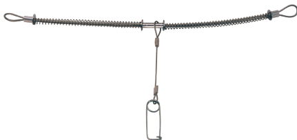
WB1C - WB1 with safety clip and lanyard