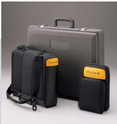
Fluke C789, C700, C781