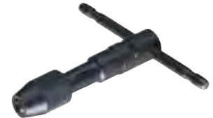
Style 244 Tap Wrench