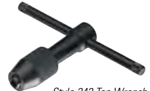
Style 243 Tap Wrench