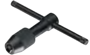
Style 242 Tap Wrench