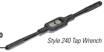
Style 240 Tap Wrench