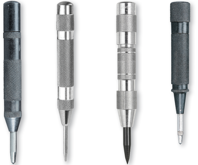
ACP/1B ACP/SS/89 ACP/77 ACP/78