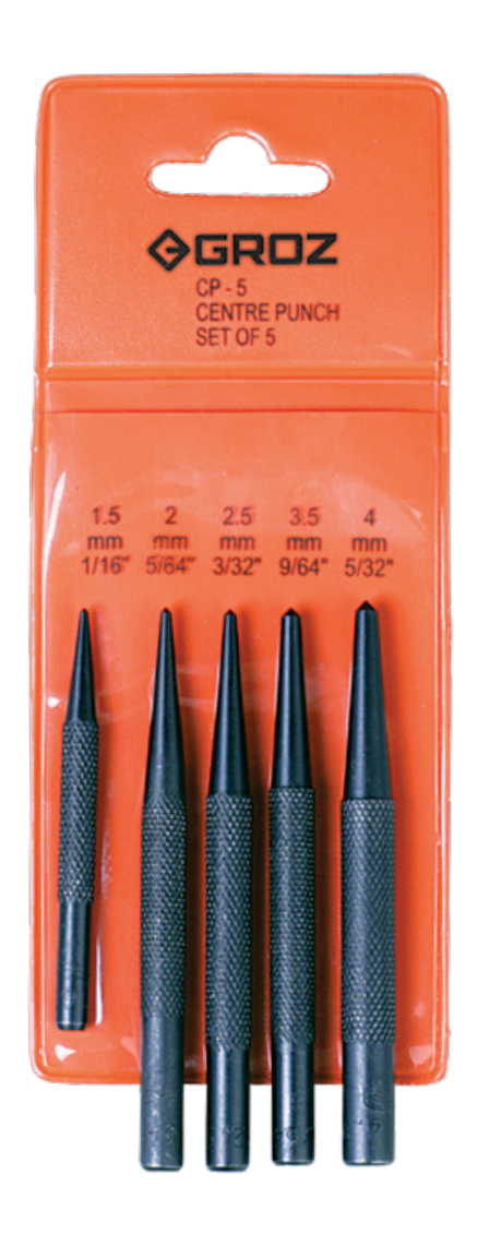
CP/5/ST (Set in vinyl pouch)