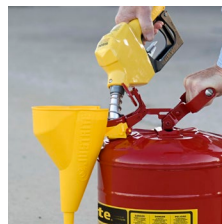
Optional 2-position polypropylene funnel aids in pouring and folds down for compact storage and filling.