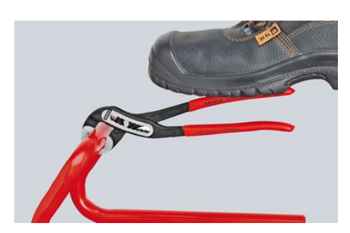
Self-locking on pipes and nuts: no slipping on the workpiece; the complete actuating force can be used to turn the workpieces; not having to squeeze the pliers handles reduces the required effort