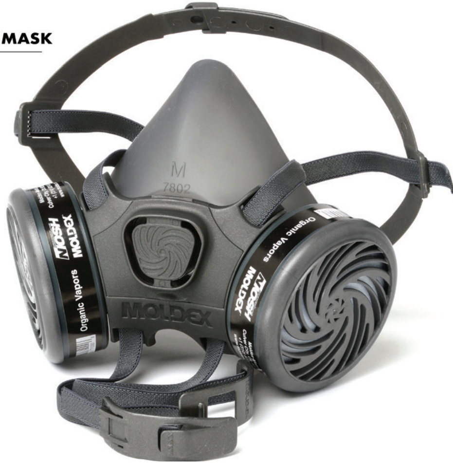
7000, 7800 and 9000 share a full line of cartridges and filters.

The 7800 Premium Silicone Half Mask has higher resistance to heat and compression, with all the enhanced comfort and durability of silicone.