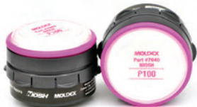
7140 Organic Vapor Cartridge/P100