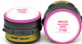
7640 Multi-Gas/Vapor Smart® Cartridge/P100