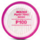
7940 P100 Filter Disk