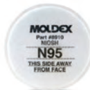
8910 N95 Filter