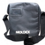
9780 Reusable Respirator Bag