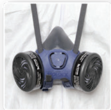
7000/7800 in Drop Down Mode

The versatile 7000/7800 has optional drop down/lock down strap modes