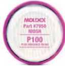
7950 P100 + Nuisance OV/AG Filter Disk