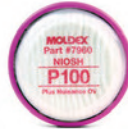
7960 P100 + Nuisance OV Filter Disk