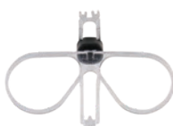
0098 Spectacle Kit