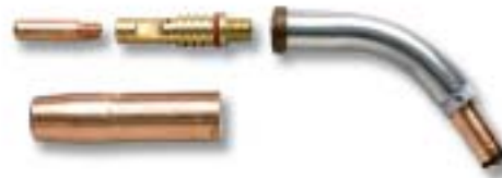
350 Amp Spray Master™ Parts