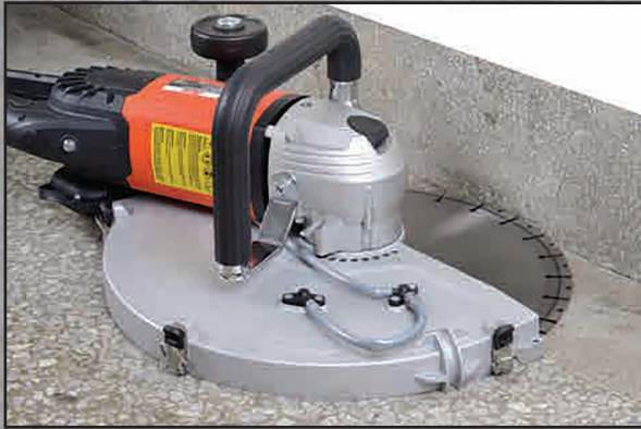
Removable guard side for flush cutting*