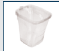
PAINT CUP LINER Model AC27-L

Ask your Sales Representative for details and availability.