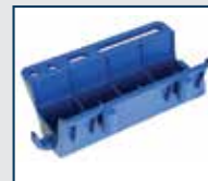
JOB CADDY Model AC54-JC