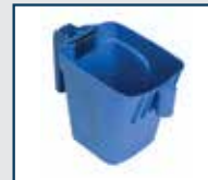
PAINT CUP Model AC27-P