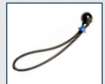
TOOL LASSO Model AC58-TL