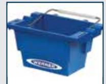
JOB BUCKET Model AC50-JB-3