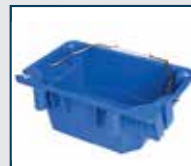
UTILITY BUCKET Model AC52-UB