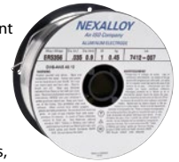
Priced per Spool