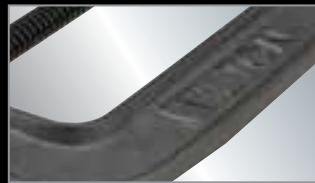
DUCTILE IRON FRAMES