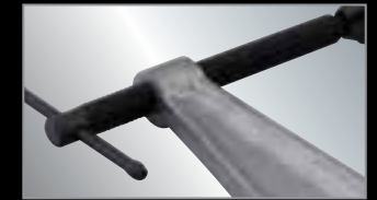
BLACK OXIDE COATING