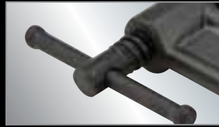
SLIDING CROSS PIN HANDLE