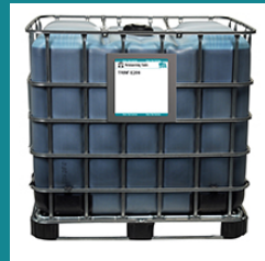
270-gallon tote SKU: E206N/NR270P UPC-12: 641238033882