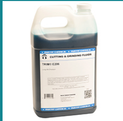
1-gallon jug SKU: E206N/1 UPC-12: 641238003052