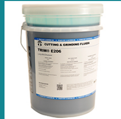
5-gallon pail SKU: E206N/5 UPC-12: 641238003083