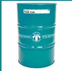
54-gallon drum SKU: E206N/54 UPC-12: 641238003090