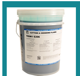
5-gallon pail SKU: E206N/5 UPC-12: 641238003083