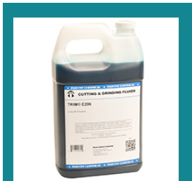
1-gallon jug SKU: E206N/1 UPC-12: 641238003052