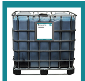
270-gallon tote SKU: E206N/NR270P UPC-12: 641238033882