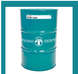
54-gallon drum SKU: E206N/54 UPC-12: 641238003090