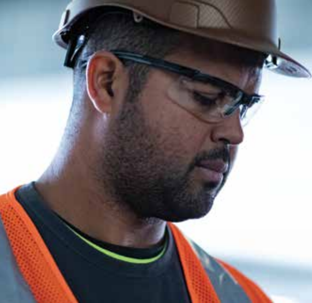
Ridgeline® / Ever-Lite / RVZ2620