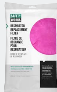
> SWX00395 P100 PANCAKE