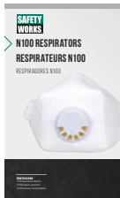
> SWX00398 10/Pack N100 HARMFUL DUST DISPOSABLE MASK WITH EXHALATION VALVE