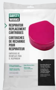
> SWX00392 TOXIC DUST