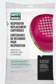
> SWX00391 SAFETY WORKS® PRO MULTI-PURPOSE

based on the contaminant plus airborne concentration and the necessary Assigned