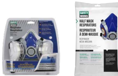
➤ SWX00318 PAINT & PESTICIDE ➤ SWX00386 Medium HALF MASK ONLY ➤ SWX00387 Large HALF MASK ONLY