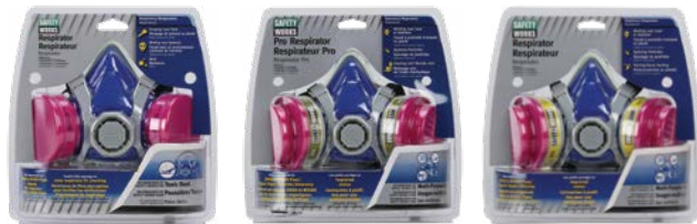
➤ SWX00319 TOXIC DUST ➤ SWX00321 SAFETY WORKS® PRO MULTI-PURPOSE ➤ SWX00320 MULTI-PURPOSE