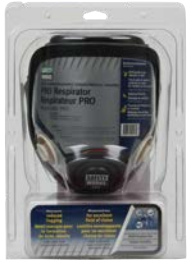
> SWX00328 SAFETY WORKS® PRO MULTI-PURPOSE