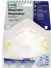
> 10103821 1/Pack N95 HARMFUL DUST DISPOSABLE MASK WITH EXHALATION VALVE