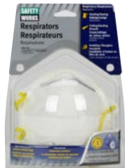
> 817633 2/Pack N95 HARMFUL DUST DISPOSABLE MASK