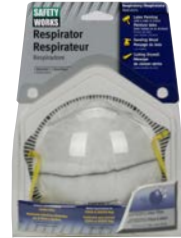
> 10102485 1/Pack N95 HARMFUL DUST DISPOSABLE MASK WITH ODOR FILTER