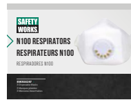
> SWX00397 3/Pack N100 HARMFUL DUST DISPOSABLE MASK WITH EXHALATION VALVE