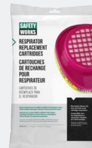
> SWX00390 MULTI-PURPOSE