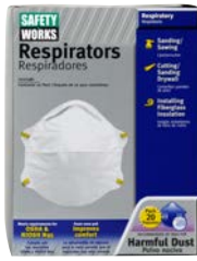
> 10102481 20/Pack N95 HARMFUL DUST DISPOSABLE MASK