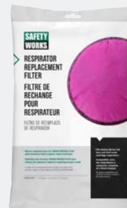
> SWX00396 P100 PANCAKE FOR NUISANCE LEVEL ORGANIC VAPORS