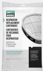
> SWX00389 ORGANIC VAPOR