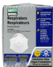
> 10102483 10/Pack N95 HARMFUL DUST DISPOSABLE MASK WITH EXHALATION VALVE