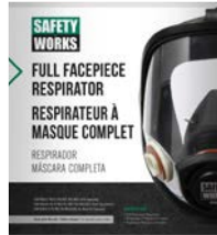
> SWX00388 FULL FACEPIECE ONLY