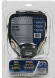
> SWX00327 PAINT & PESTICIDE