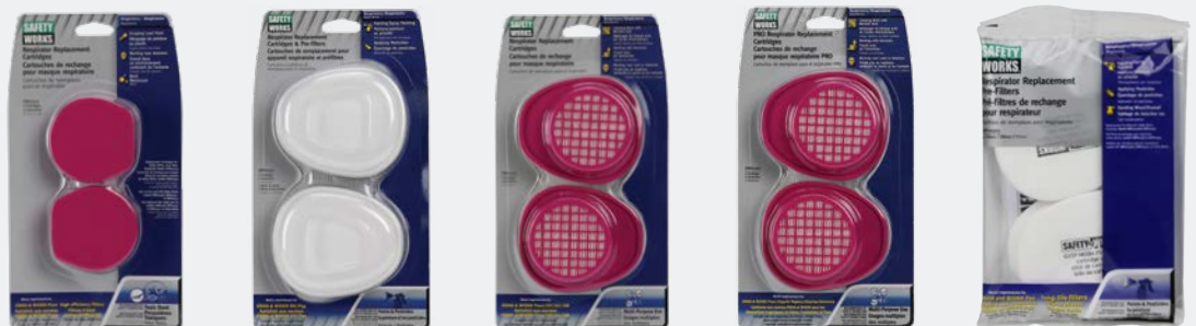
➤ SWX00324 TOXIC DUST ➤ SWX00322 PAINT & PESTICIDE ➤ SWX00325 MULTI-PURPOSE ➤ SWX00326 SAFETY WORKS® PRO MULTI-PURPOSE ➤ SWX00323 PRE-FILTERS

IMPORTANT: Respirator and cartridge type must be chosen