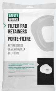
> SWX00394 FILTER PAD RETAINER