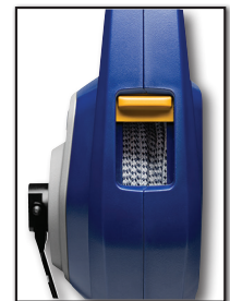
Large Sliding Door