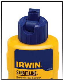
Hi-flow Nozzle Cap on Permanent Staining Chalk

IRWIN® STRAIT-LINE® marking chalks have an innovative flip-top cap that keeps the chalk in the bottle where you want it. The flip-top cap seals the chalk in an airtight chamber, keeping out moisture and reducing the risk of clumping.